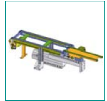
Unloading conveyor for «Carrier»