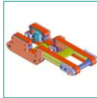
Conveyor with lifting device (rear) for transverse wafer dispatch